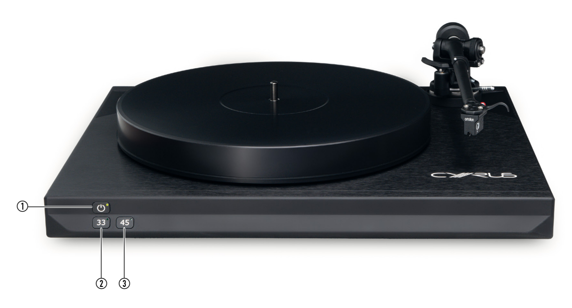
Key to the front panel drawing